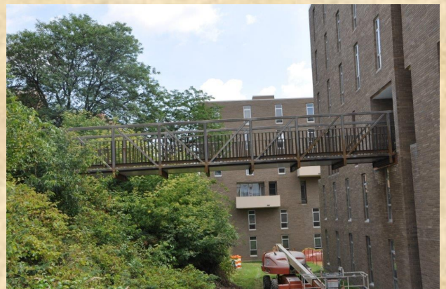
Installed on time!