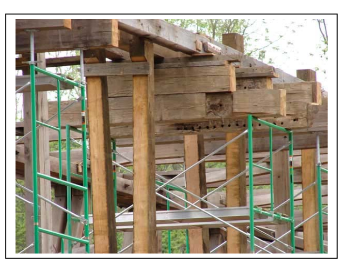
May 10th Here are some of the old joint pieces that were removed from the bridge