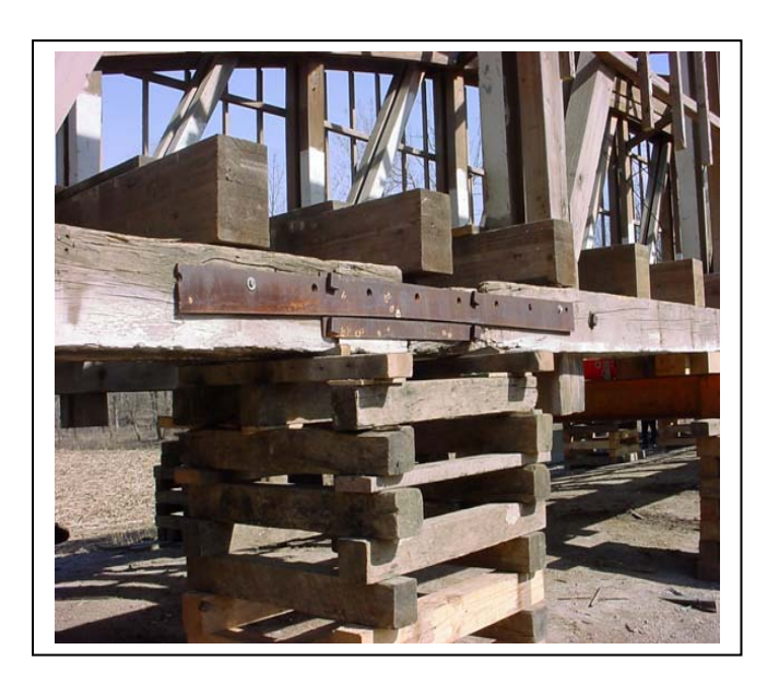
March 20th Scaffolding has been erected to support the Jackson Bridge as the original timbers are being removed. The floor has been removed and the arches are being disassembled.