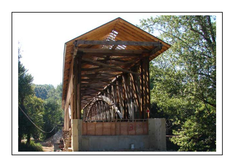
September 3rd The work continues on the north abutments. Forms have been set and concrete has been poured