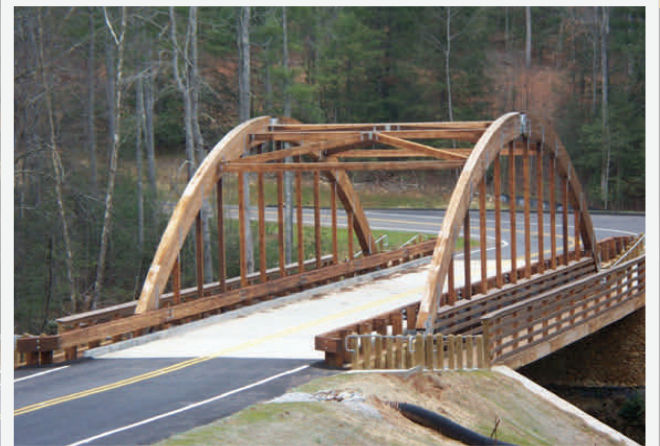
Paddy's Creek Glue-Lam Arch Bridge-SC

Art Thureson, Inc has been supplying glued laminated timber vehicle and pedestrian Bridges since 1980. Glued laminated timber bridges are naturally beautiful, durable and cost-effective . Engineered stamped drawings and calculations. Glued laminated timber bridges are pre-fabricated prior to pressure-treatment to ensure a long and useful service life.