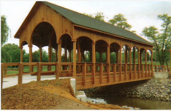
Ford Field Glue-Lam Covered Bridge-MI