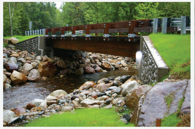
South Gale Glue-Lam Girder Bridge-NH